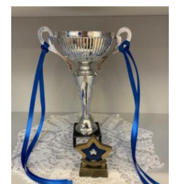
Trophies for Brave Blues

Brave Blues win hands down this term in the House Point Battle.