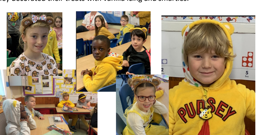
Outfits in support worn by many pupils

On Friday 13th November 2020 Hartlip School brought in 2 pounds or more to celebrate Pudsey day one pound was for dressing up Pudsey themed. The other pound was for decorating cupcakes and biscuits. Your Pudsey themed outfit could be something yellow, something to do with bears or something spotty. You could even come in your Pudsey themed pyjamas if you wanted to. They decorated their treats with vanilla icing and smarties.