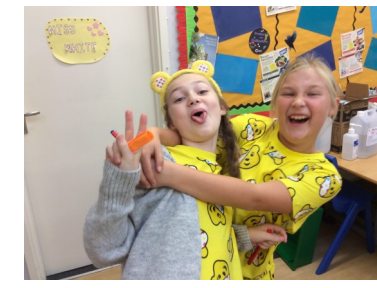
Dress-up fun in Eagles