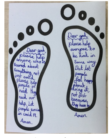
Prayers and messages for a journey.