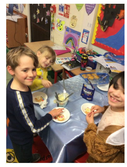
Blackbirds class decorating cookies