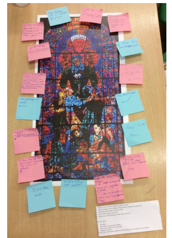
Stain glass reflection and identifying