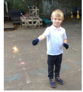
Above, pupil enjoying a sparkler Right, pupils creating founders art.