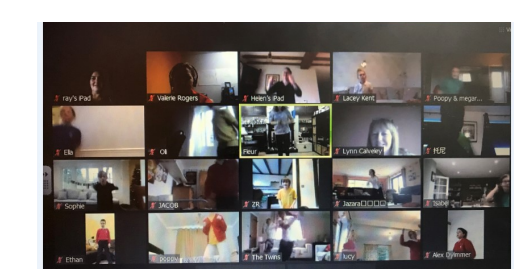
Active zoom session in action

The whole Hartlip primary had to work from home for two weeks this term as numbers around Swale and Medway soared to the highest in the country! This happened for two weeks (24th of November-6th of December 2020). The school has suffered two terms with the appalling disease disrupting their learning, the children are hoping the next four terms go differently. The pupils hope to never encounter the dreadful virus in the school premises again.