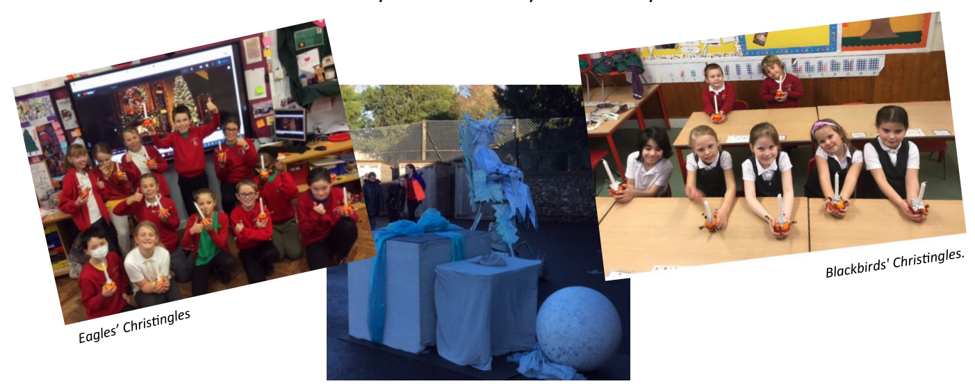
Surprise visit from the Snow Queen

Every year at Hartlip, a Christingle service is held and children learn about the meaning behind Christingle. They find out what the orange, red ribbon, four sticks with treats and the candle mean. Remember to ask the children what they found out. Do you think they can remember it all?