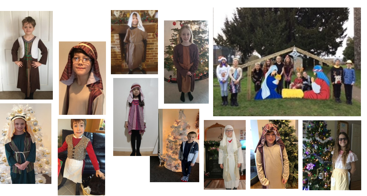
Children in their costumes at school and home so all could join in.