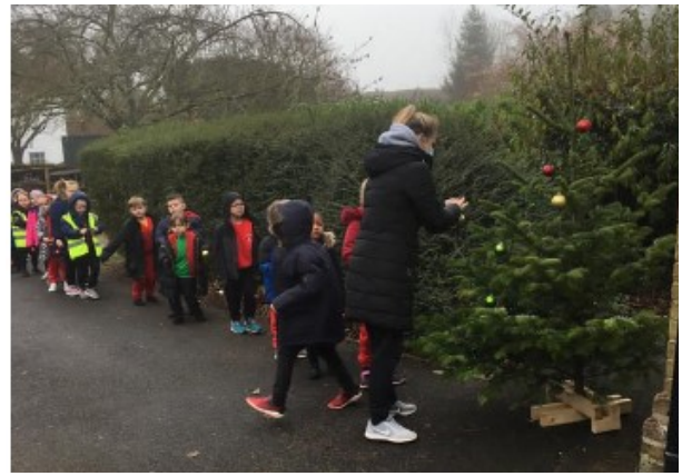
Robins decorating the tree

Robins class had great fun sorting all the baubles and adding a wish to each before placing it on the school tree for all parents and children to enjoy.