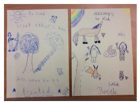
Reflection posters made by Peacocks