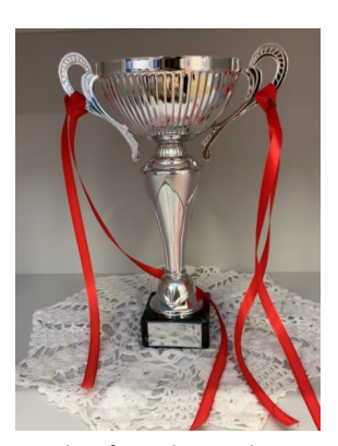
Trophies for Radiant Reds