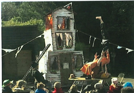
The Crow House performers acrobatics.

Friday morning, there was a van parked on the school drive; lots of equipment came out onto the playground. There was a massive tall broken house. It was for the show!