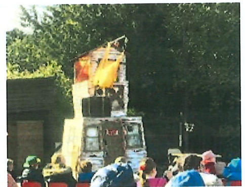
Pupils watching The Crow House performance