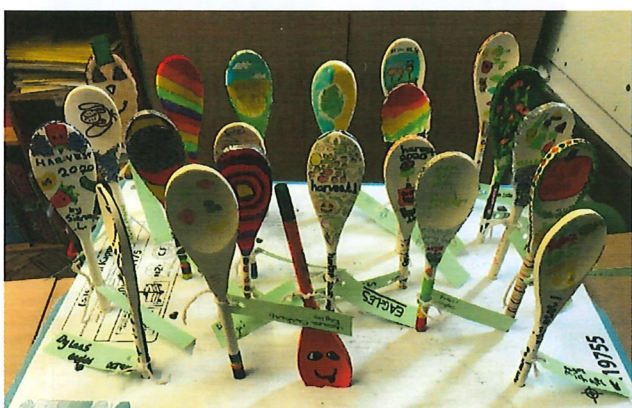
Some of the spoons decorated by pupils

All pupils got to decorate a spoon (needle) they found in the haystack to a harvest theme of their choice.