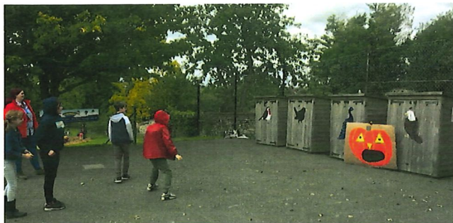
Pupils taking turn in pumpkin apple toss.

Friday afternoon everyone in Hartlip School had lined up (one class at a time) in front of a cardboard 2D pumpkin. The person at the front was handed an apple then had to try and toss it through the pumpkins mouth. The pumpkin was painted orange, yellow and black with two triangle eyes. It was really tricky but great fun, with lots of mess.