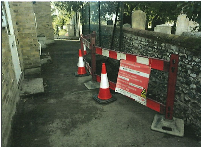
Hole and barriers in school drive

Adults bringing children into school were asked to queue along the church path and be escorted at a safe distance for each allocated time.