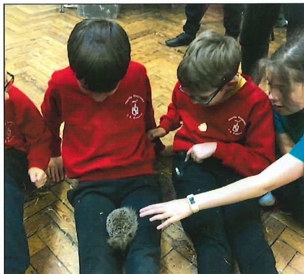
Pupils getting close –up with their prickly friends