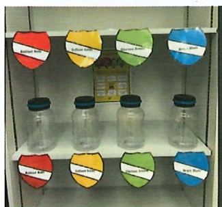
New house point counting jars