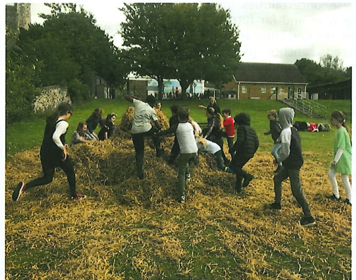
Eagles class off on a hunt.

Turn to page 2 and 3 to see the full story.