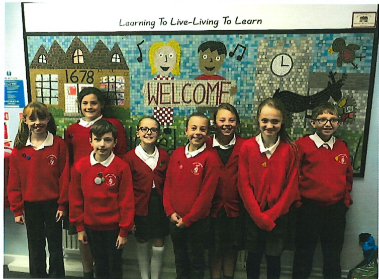
Hartlip's new House Captains and Vice Captains

These VIPs have important jobs like: counting the amount of tokens in each class, helping the teachers, leading the sports day teams and reporting and writing the Hartlip Newspaper every term with the support of their team members.