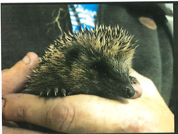
One of the rescued hedgehogs

Three days later when I was in bed, my mum and dad went on a baby hedgehog/ underweight hedgehog hunt, they found three more baby hedgehogs, we've only named four and their names are Jayne, Pickle, Curly boy and Hagrid there is one more to name, we don't know what to name him yet. My family will release them in April 2021. But until then I will look after the hedgehogs by weighing, filling up their food plate and their water bowl and then when the time comes we'll release them.