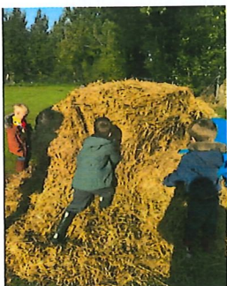
Pupils in Robins hunting for needles

Pupils from Hartlip School were invited to take part in finding a needle in a haystack, apple toss and spoon decorating, as part of the PTFA Harvest Fun Day.