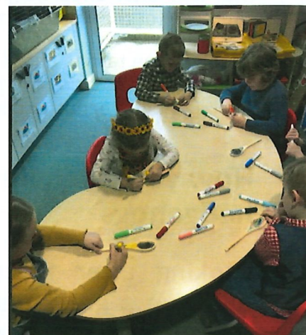
Robins class decorating their spoons

It was so difficult to pick as they all looked amazing!