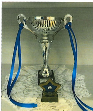
Trophies for Brave Blues