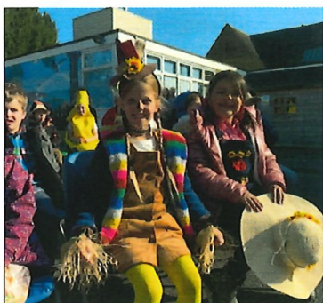
Peacocks enjoying fundraising dress-up